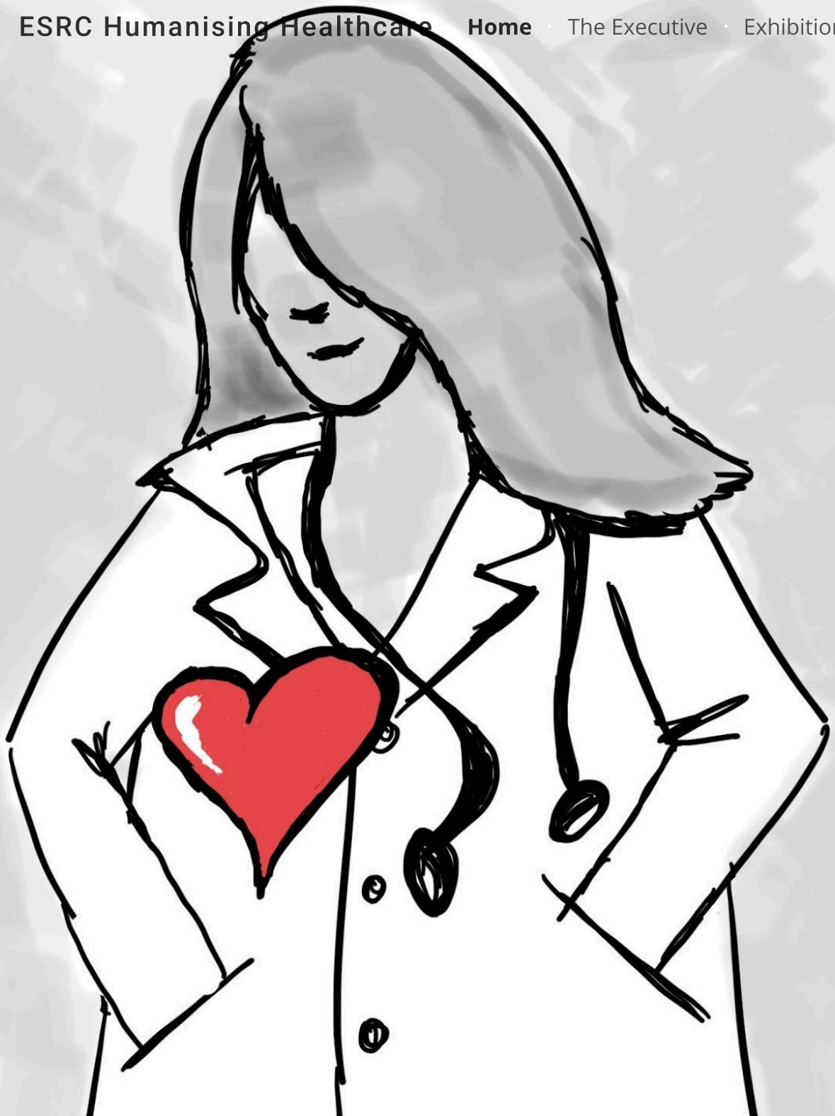
Image of Humanising Healthcare Project logo