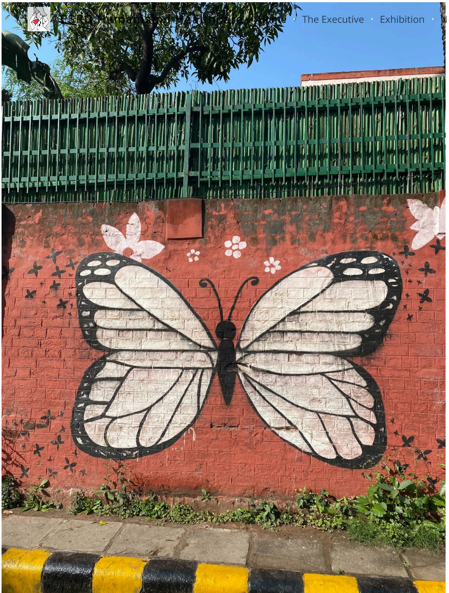
Image of a butterfly symbolising hope