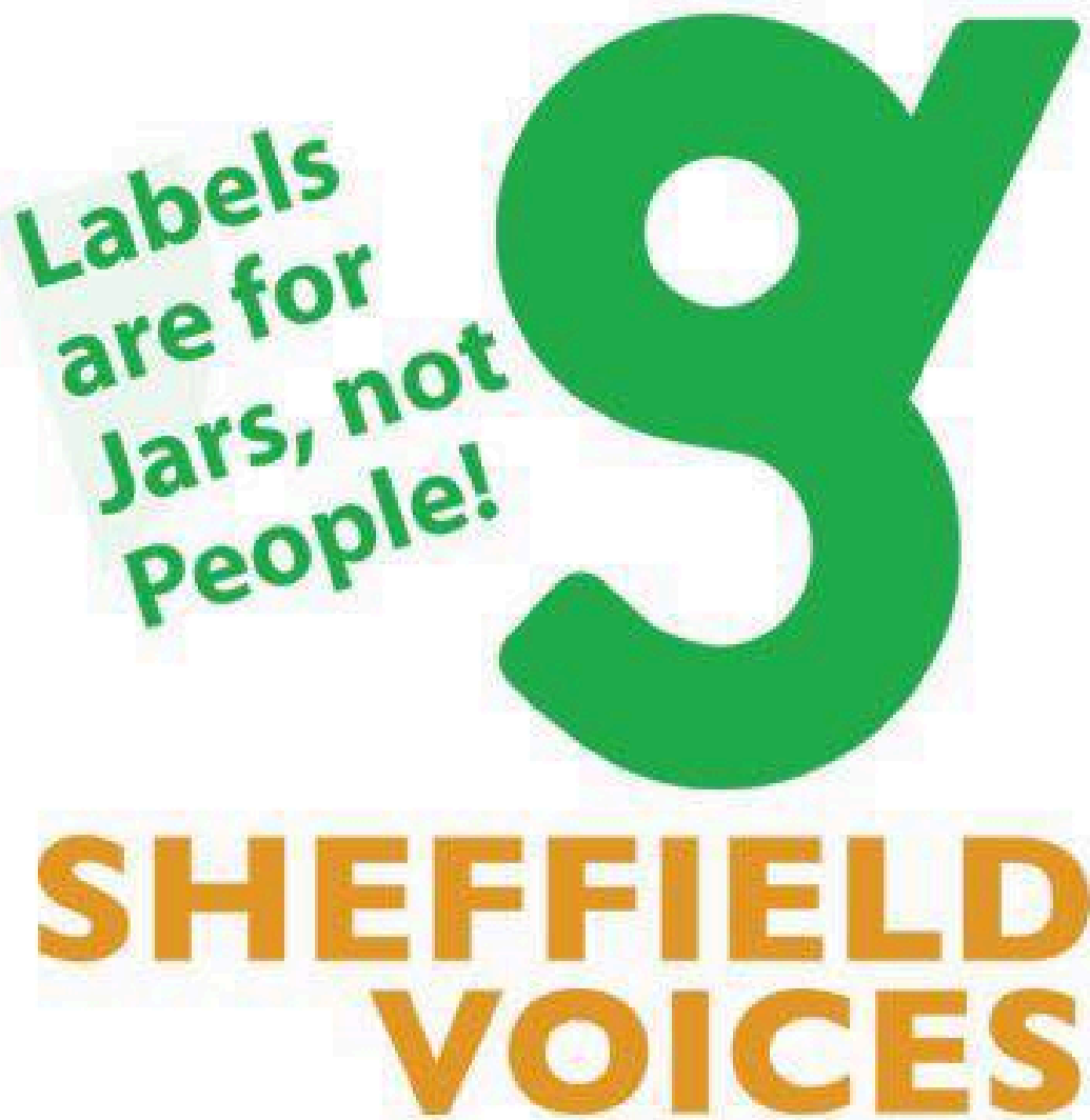
Sheffield Voices logo